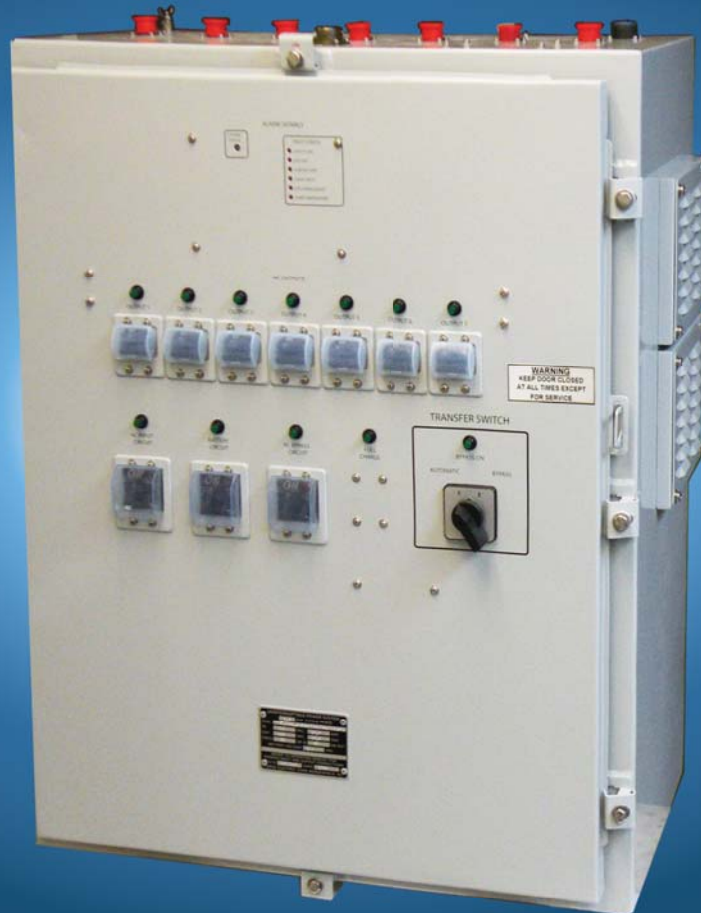
OPTIONAL FEATURES SHOWN